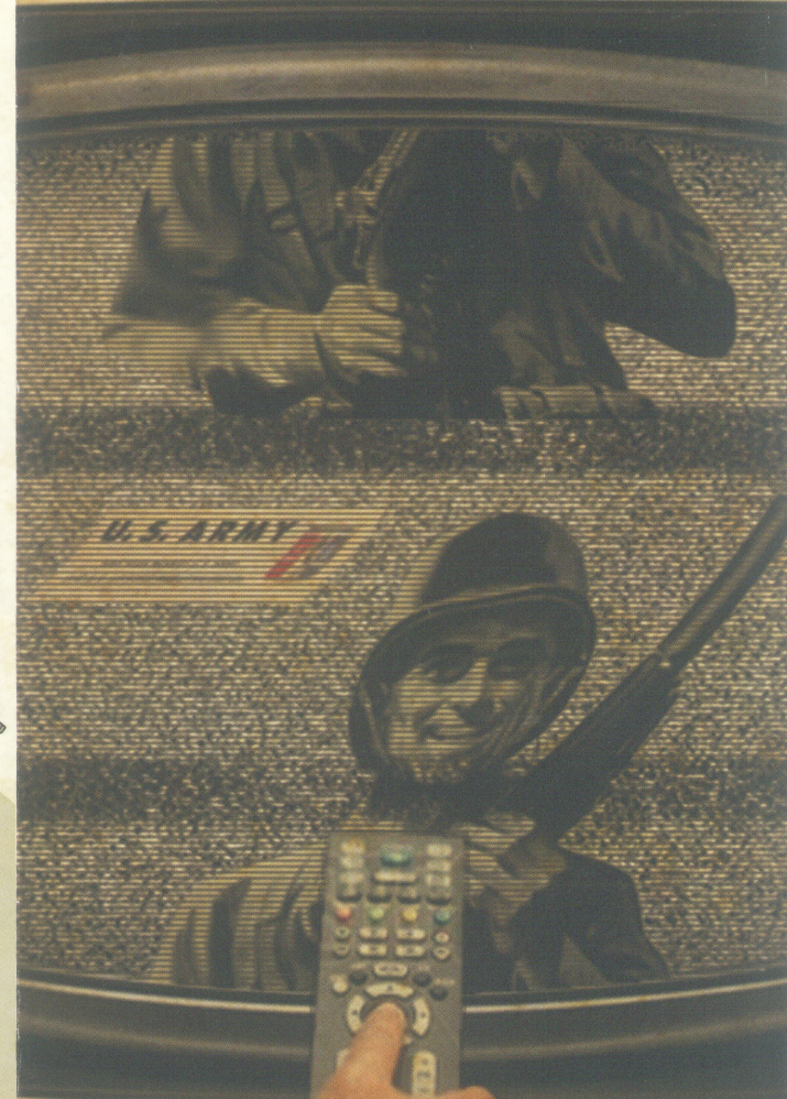
Graphic design: Design Action Collective

KNOW BEFORE YOU GO 'CAUSE THERE'S NO RESET BUTTON